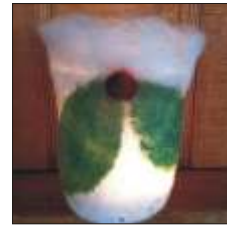
Tiewyan Farm Art for Home and Body