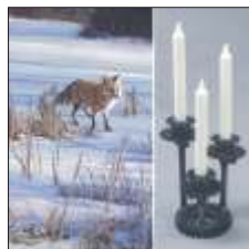
Kidera Designs Paintings, Metal Sculptures