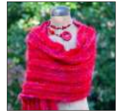
Dancing Leaf Farm Jewelry, Fiber, Art