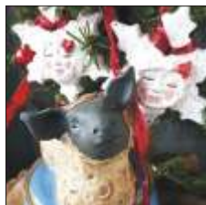
Niswander Ceramics Sculpture & Art Pottery