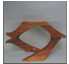
2 Griffins Fine Furniture