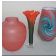
Art of Fire Hand-blown Glass