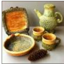
Dusty Road Pottery Pottery