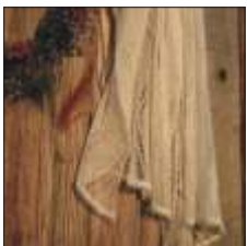
Kiparoo Farm Fiber, Woodenware