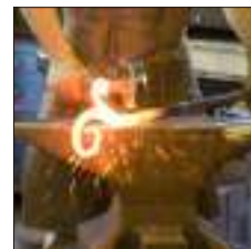
Iron Antler Forge Decorative Metal Sculpture