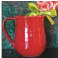
Something Earthy Pottery & Gift Gallery