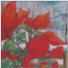
Sugarloaf Studio Pastels, Prints, Paintings