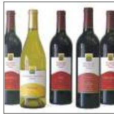
Sugarloaf Mountain Vineyard & Winery