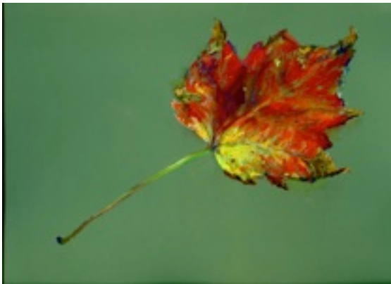
Autumn Leaf, pastel, 9” x 12”