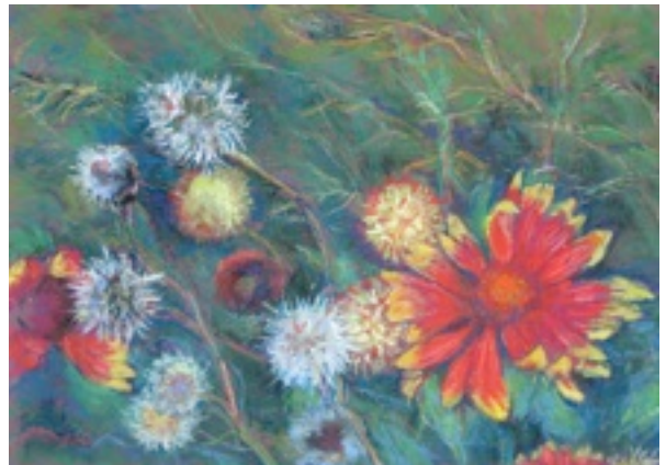
“Blanket Flowers”, pastel, 10” x 14.25”

Hope to see you at the Holiday Tour! I'm busy decorating, and framing, and finishing work to share with you. Many new items and a special gift for purchases over $100. Wishing you all good things for the Holidays!